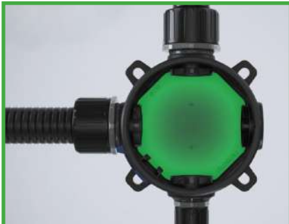
Maximum internal wiring space - no protruding threads or locknuts