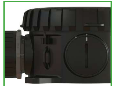
Blank off unused outlets

For more information contact us on T: +44 (0) 1675 466 900